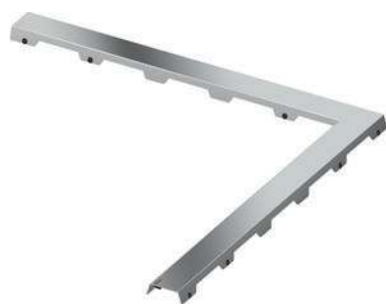
Design "steel II"